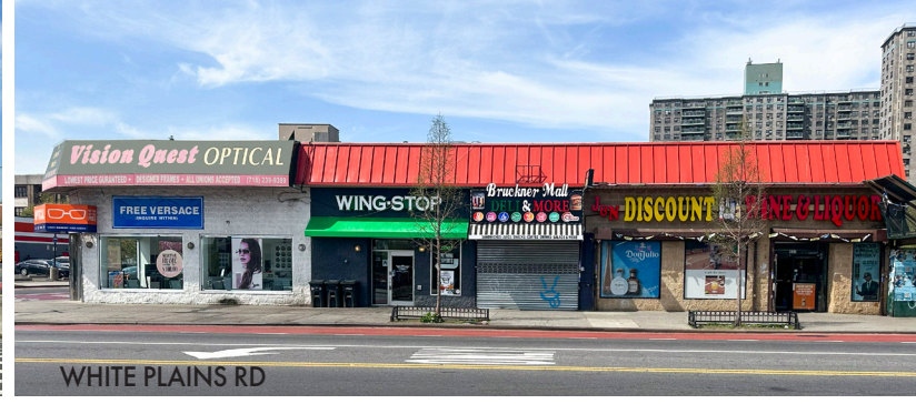
WHITE PLAINS RD