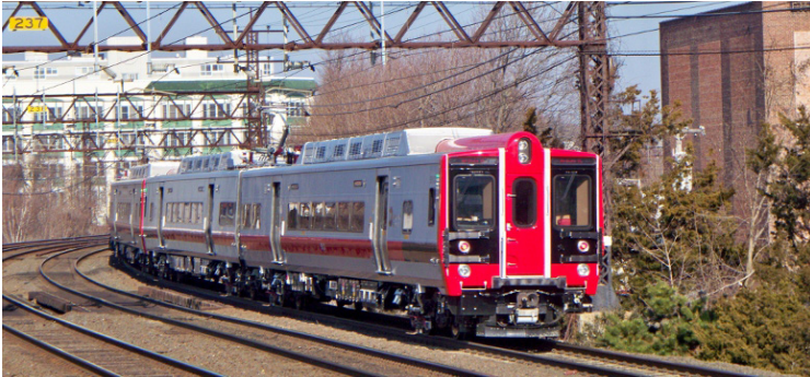
DIRECT ACCESS TO PORT CHESTER METRO NORTH STATION