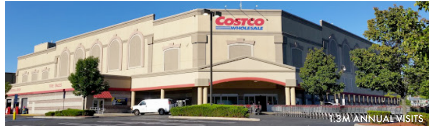
1.3M ANNUAL VISITS