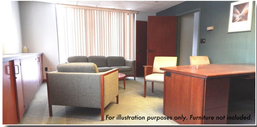
For illustration purposes only. Furniture not included.

CONTACT EXCLUSIVE AGENTS: STEPHEN KAUFMAN: 914.968.8500 x315 • skaufman@rmfriedland.com ANDY GROSSMAN: 914.968.8500 x322 • agrossman@rmfriedland.com