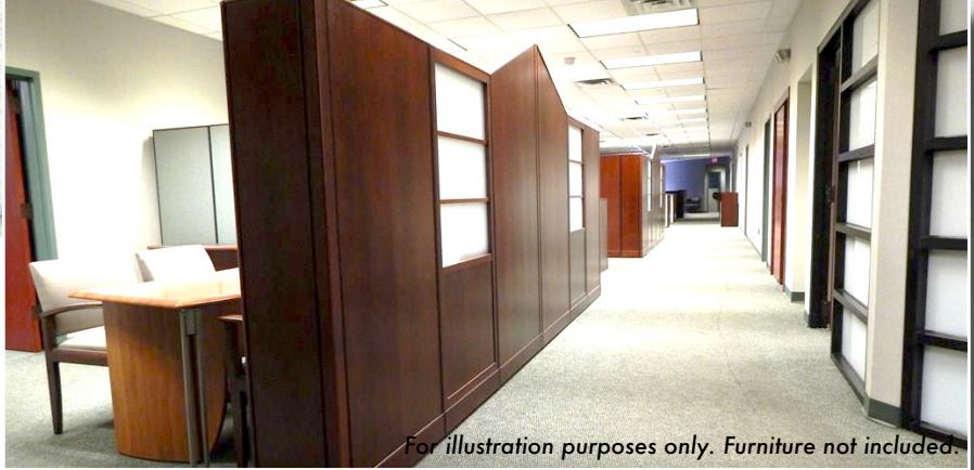
For illustration purposes only. Furniture not included.